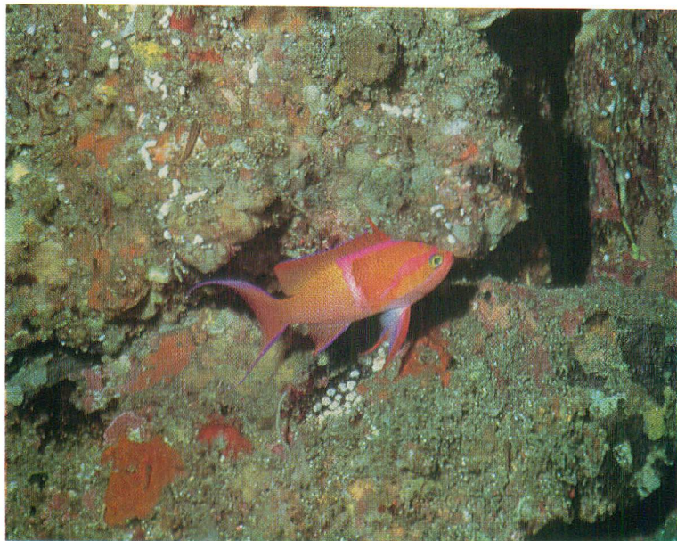
Fig. 2. Underwater photograph of Anthias ( Pseudanthias ) leucozonus , taken at a depth of about 40 m on a rocky reef off Futo, Izu Peninsula, Shizuoka Pref., on February 27, 1977.

nated, outer rays produced; spinous dorsal fin not scaled; predorsal bones 3; color pattern in life described below.