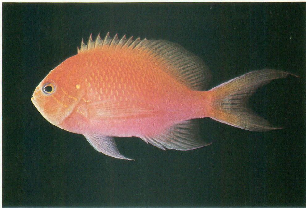
Fig. 1. Serranocirrhitus latus Watanabe, 63 mm SL, BPBM 9543; Palau Islands (John E. Randall).