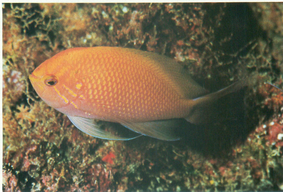
Fig. 2. Serranocirrhitus latus ; Willis Island, Coral Sea.