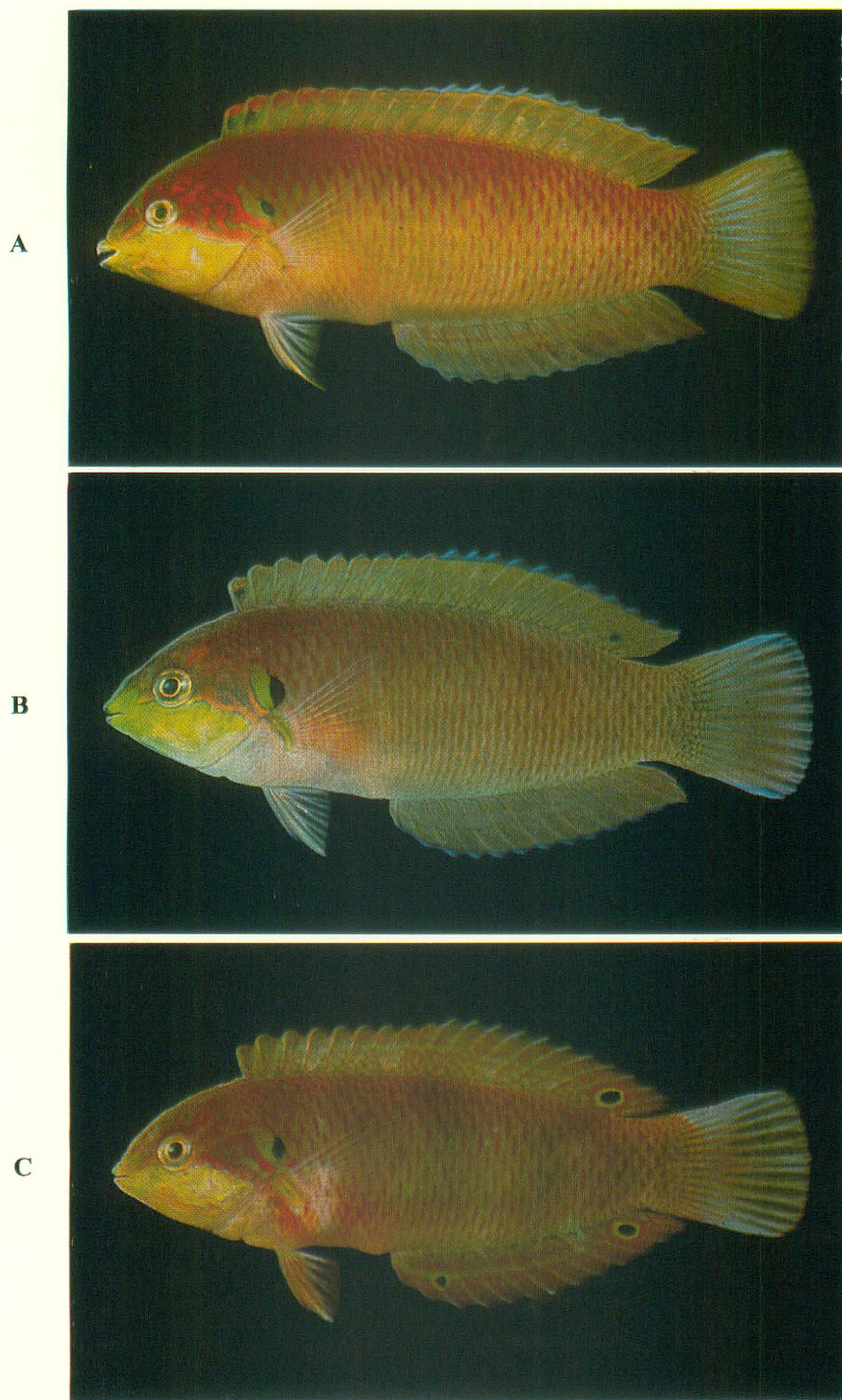
Fig. 1. Type specimens of Macropharyngodon moyeri from Miyakejima, Izu Islands, Japan: A) BPBM 20329, male, 84.0 mm SL; B) holotype, NSMT-P 18352, female, 51.5 mm SL; C) CAS 38089, juvenile, 43.5 mm SL. Photographs of freshly preserved specimens.